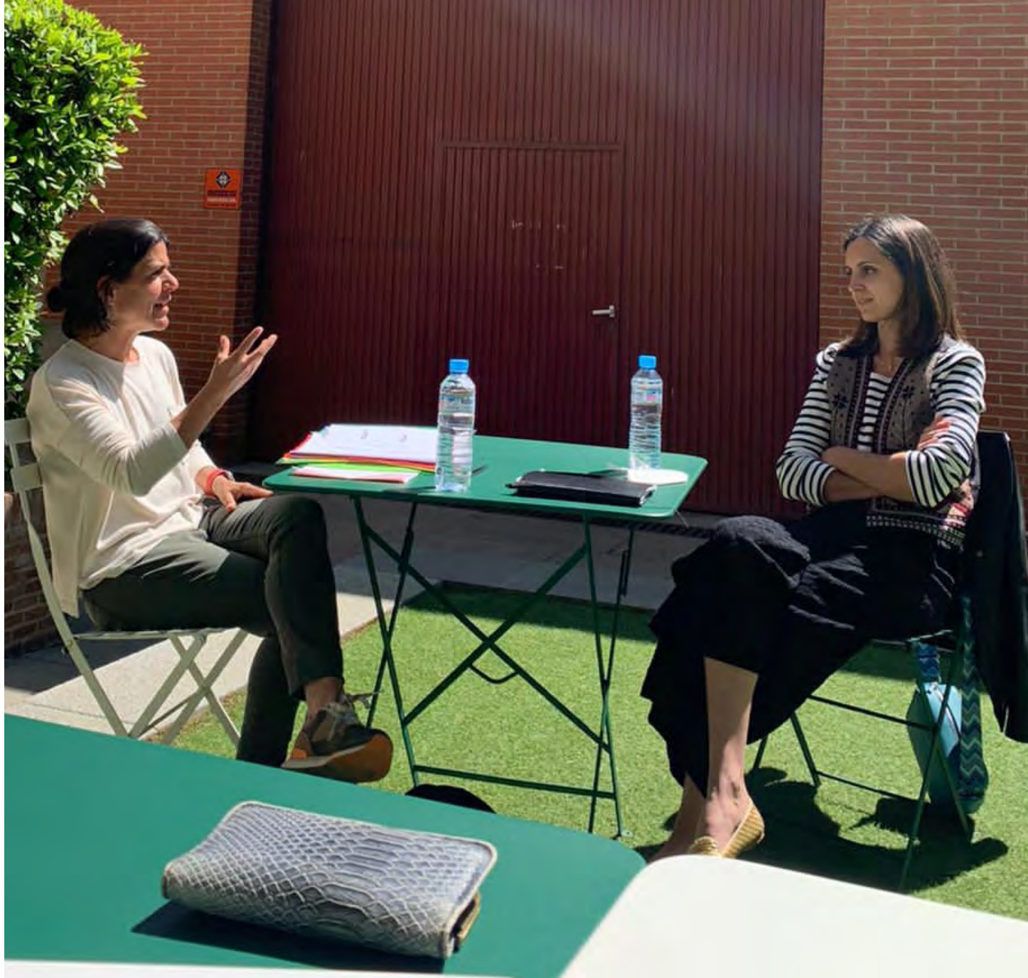
Building trust with candidates and creating an environment where mutual learning can happen is key. Spain and Portugal Second Opinion Interview, 2021.