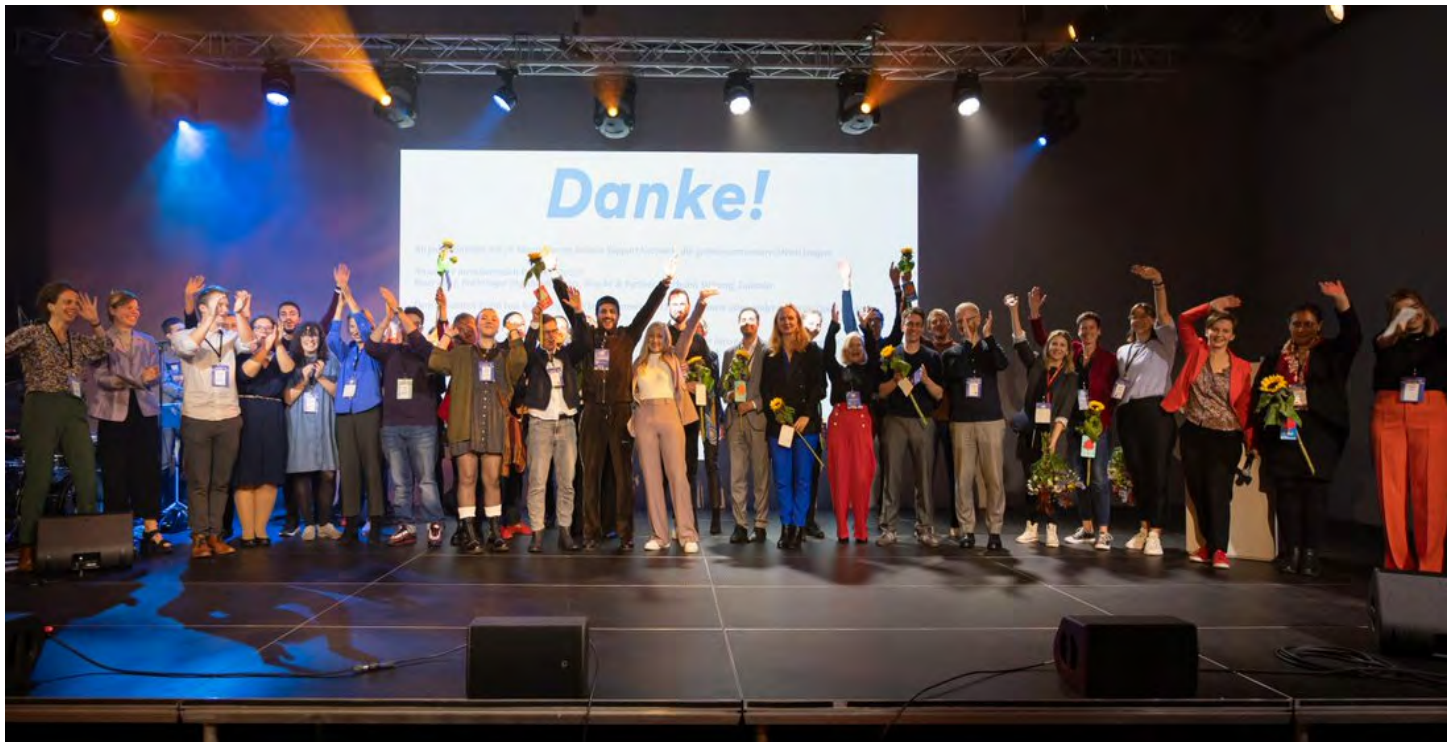
Germany's Fellows presentation, 2023.