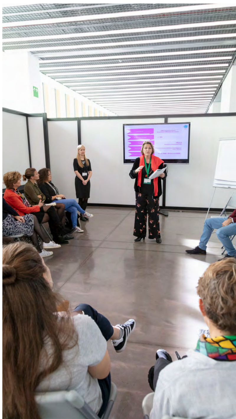
Ashoka's gatherings bring together Fellows, and other key stakeholders, often including candidates, to learn from each other and grow in their changemaking. Ashoka Changemaker Summit 2019, Barcelona.

Many Fellowship programmes rely initially on written applications. This puts the burden on candidates who are already stretched to share information that may be easily found online. This can create barriers for leaders who do not have the training or resources to fill out rigid forms. Written applications are impersonal by design; candidates merely answer a pre-packaged list of queries. Our focus on personalizing each conversation creates goodwill and trust. It also acknowledges in a tangible way each candidate's individual journey. Some colleagues also pointed out that by asking questions in the first interview about the problems candidates wish to solve and why they are so committed, candidates then have the space to talk about what drives them in language that matters to them. Venture staff thereby initially prioritise learning over evaluating, understanding over advising. And they ask 'why?' multiple times, often giving