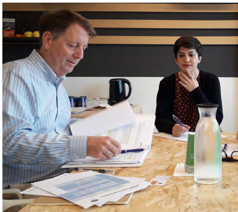
Italy Second Opinion and Panel, 2018.