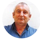
John Bird Elected in 2015 The Big Issue

Breaking down barriers to physical activity while simultaneously encouraging community cohesion, parkrun empowers and equips volunteers to organise free weekly 5k runs.