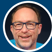
Jimmy Wales Founder of Wikipedia, Ashoka Fellow

A changemaker is anyone who identifies a social problem, develops a solution to address it, mobilizes others, and works towards the good of all.